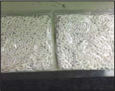
Three suspects were arrested after attempting to deliver Ecstasy pills in the form of "Mollies".

Inside Lam's home, investigators found a small but functional indoor Marijuana grow. Several Marijuana plants and