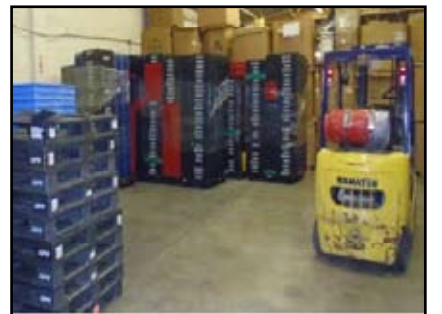
A task force has been dedicated to restore plastic pallets and trays that are being stolen, grinded up, and resold.