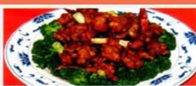
Orange Flavored Chicken

Crispy chicken with tangerine taste, surrounded by steamed broccoli