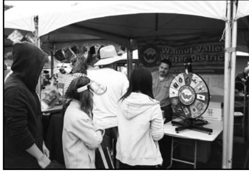
The Walnut Valley Water District booth at the Diamond Bar party was a hit last Saturday, many people lined up for a chance to win prizes.