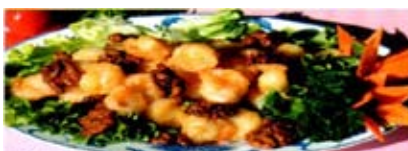
Walnut Honey Shrimp

Lightly battered shrimp served with sweet mayonnaise and honey crusted walnuts