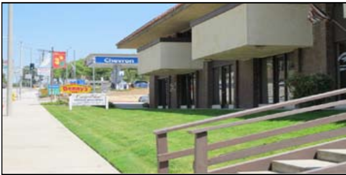
Canyon View Offices at 21308 Pathfinder Rd., Diamond Bar

Canyon View Plaza is an ideal location for multipurpose offices with 24/7 access to building. Located right next to the 57 and 60 fwy makes it highly visible. It is across the street from Diamond Bar High School. Offices start at $500 for Executives Suites and include FREE utilities and cleaning service. Fios, satellite service, wireless internet and Direct TV. Great space for retail, office, medical, small sandwich shop, nail salon and school related business like tutoring and possible art studio. Some of the current tenants are psychologist, dentist, beauty salons, tutoring, driving school, used car dealers, and music teacher.