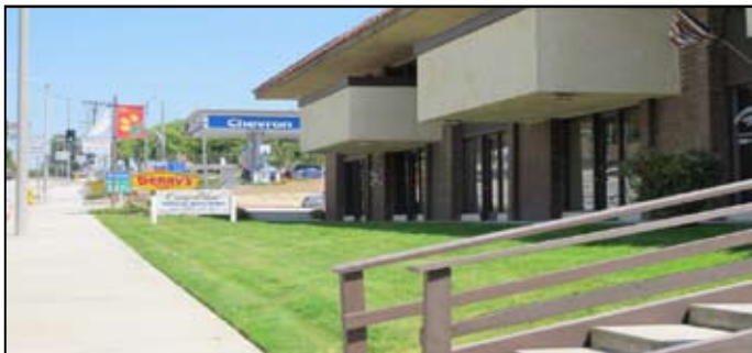
Canyon View Offices at 21308 Pathfinder Rd., Diamond Bar

Canyon View Plaza is an ideal location for multipurpose offices with 24/7 access to building. Located right next to the 57 and 60 fwy makes it highly visible. It is across the street from Diamond Bar High School. Offices start at $500 for Executives Suites and include FREE utilities and cleaning service. Fios, satellite service, wireless internet and Direct TV. Great space for retail, office, medical, small sandwich shop, nail salon and school related business like tutoring and possible art studio. Some of the current tenants are psychologist, dentist, beauty salons, tutoring, driving school, used car dealers, and music teacher.