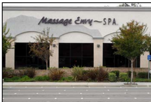
Massage Envy is located at 1195 S. Diamond Bar Blvd. Suite B, Diamond Bar CA 91765. Or you can reach them at (909) 612-9700.