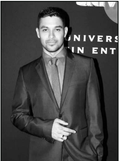
Wilmer Valderrama at the UMLE after-party.

Wilmer Valderrama also announced a new song collaboration with Sky Blu of LMFAO and