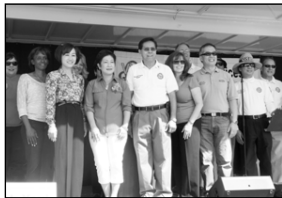
Various members of City Government gather at the main stage as part of the opening ceremony at the Walnut Family Festival.