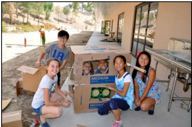
Sixth graders showed off their cardboard tank.