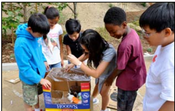
Sixth graders created the popular arcade claw game.