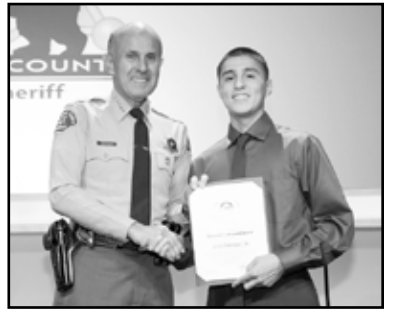
Local Youth Earns Sheriff Leroy D. Baca Youth Scholarship Award

County utilizes seven individual programs that work with at-risk youth in Los Angeles County, helping children and teens pursue happy, productive lives — and steer clear of crime, drugs and other issues that can damage young lives. The Foundation is dedicated to providing them with safe facilities, planned programs, and the vital tools they need to thrive and succeed in life. The programs include the Foundation's 17 Youth Activities League centers, as well as Success Through Awareness and Resistance (STAR); Vital Intervention Directional Alternative (VIDA); Sheriffs Teaching At-Risk Teens (START); Bicycle Education and Registration