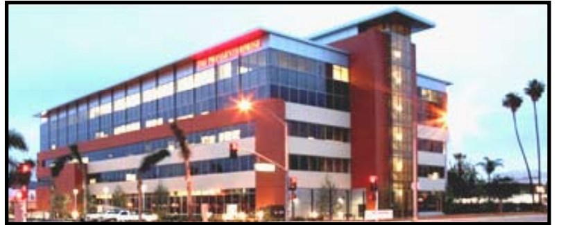
The Press-Enterprise in Riverside, CA

The Register's circulation has declined since Freedom's acquisition last year, and the purchase of The Press-Enterprise may be an effort to boost sales with an investment in future growth. Although they doubled their reporting and editorial staff and launched the Long Beach Register, they also stopped their 401K employee matching program in January, reportedly due to a poor financial performance. Freedom is also in the midst of a $17.5 million lawsuit, filed in Delaware on