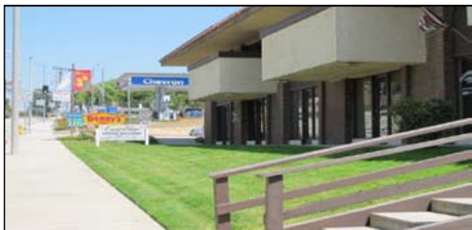
Canyon View Offices at 21308 Pathfinder Rd., Diamond Bar

Canyon View Plaza is an ideal location for multipurpose offices with 24/7 access to building. Located right next to the 57 and 60 fwy makes it highly visible. It is across the street from Diamond Bar High School. Offices start at $500 for Executives Suites and include FREE utilities and cleaning service. Fios, satellite service, wireless internet and Direct TV. Great space for retail, office, medical, small sandwich shop, nail salon and school related business like tutoring and possible art studio. Some of the current tenants are psychologist, dentist, beauty salons, tutoring, driving school, used car dealers, and music teacher.