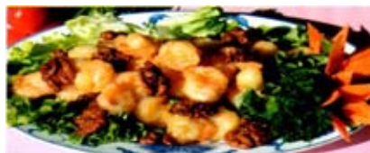
Walnut Honey Shrimp

Lightly battered shrimp served with sweet mayonnaise and honey crusted walnuts