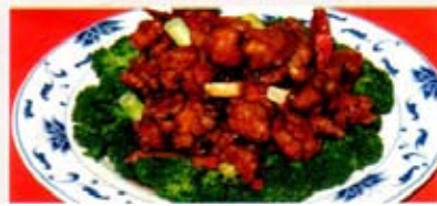
Orange Flavored Chicken

Crispy chicken with tangerine taste, surrounded by steamed broccoli