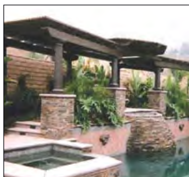
South Coast Patio is located in Corona and can be reached at (951) 277-0956.