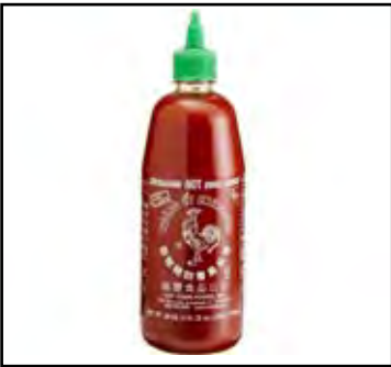
Sriracha hot sauce has caused an odor uproar in Irwindale.