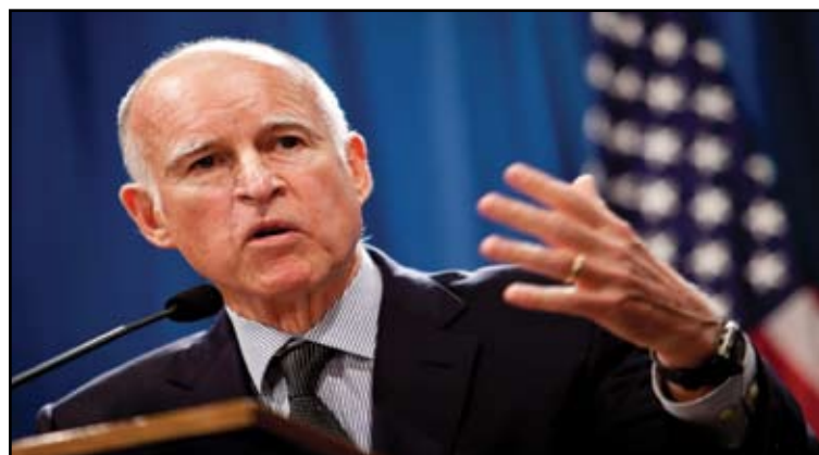
Gov. Jerry Brown