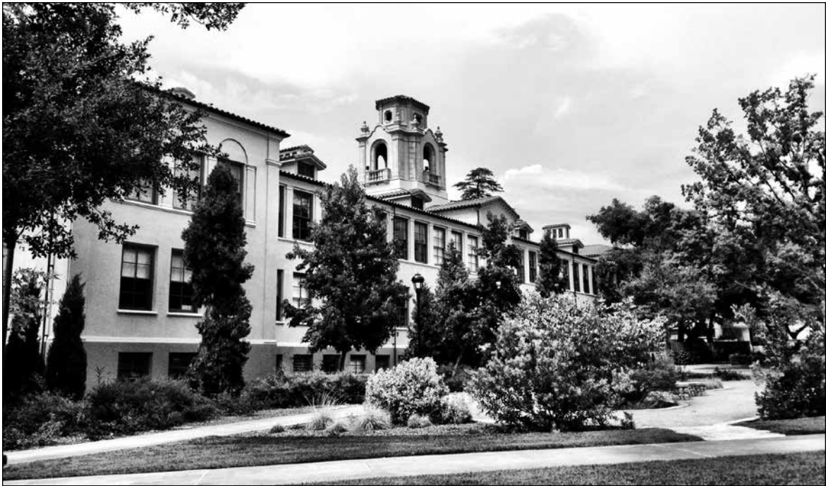
Pomona College campus in Claremont, CA

Pomona College refers to its students as “Architects of Education.” With an average class size of 15 and large-scale resources, students are easily able to cultivate a great enthusiasm for learning by collabo-