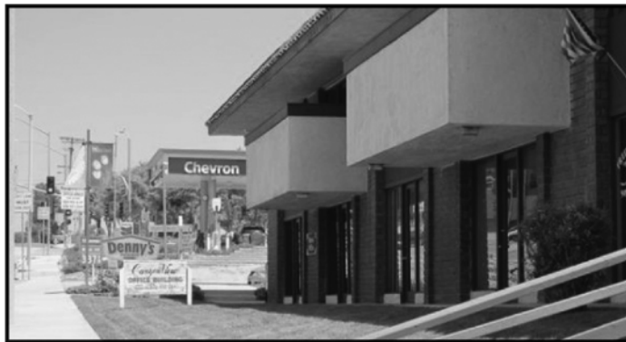
Canyon View Offices at 21308 Pathfinder Rd., Diamond Bar

Diamond Bar-Canyon View Plaza is an ideal location for multipurpose offices with 24/7 access to building. Located right next to the 57 and 60 fwy makes it highly visible and easy to find. It is across the street from Diamond Bar High School and Chevron Gas Station. Offices are all inclusive. Starting at $600 for an executive suite. Offices range in different size up to 2300 sq ft. Free utilities, including water, trash, gas, gardening and cleaning service. Verizon is the phone carrier. Wireless internet FIOS and direct tv are available. Great space for office, retail, medical, acupuncture, nail salon, beauty salon, and school related business like tutoring. Some of the current tenants are psychologist, dentist, beauty salon, real estate brokers, mortgage brokers, tutoring, driving school, music teacher, art studio, doctor, Diamond Bar Tailoring, and used car dealers.