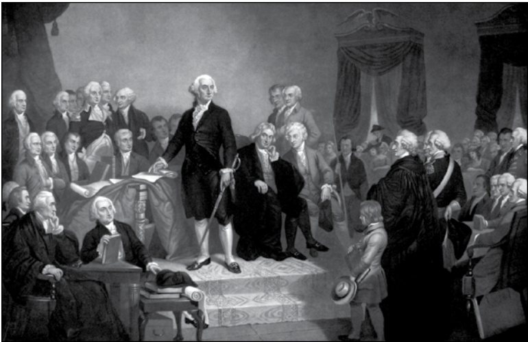
George Washington give his 1789 Inaugural Address at the Old City Hall in New York.

On April 30, 1789, George Washington is sworn in as the first American president and delivers the first inaugural speech at Federal Hall in New York City. Elements of the ceremony set tradition; presidential inaugurations have deviated little in the two centuries since Washington's inauguration. In front of 10,000 spectators, Washington appeared in a plain brown broadcloth suit holding a ceremonial army sword. At 6'3, Washington presented an impressive and solemn figure as he took the oath of office standing on the second balcony of Federal Hall. With Vice President John Adams standing beside him, Washington repeated the words prompted by Chancellor Robert R. Livingston, kissed the bible and then went to the Senate chamber to deliver his inaugural address.