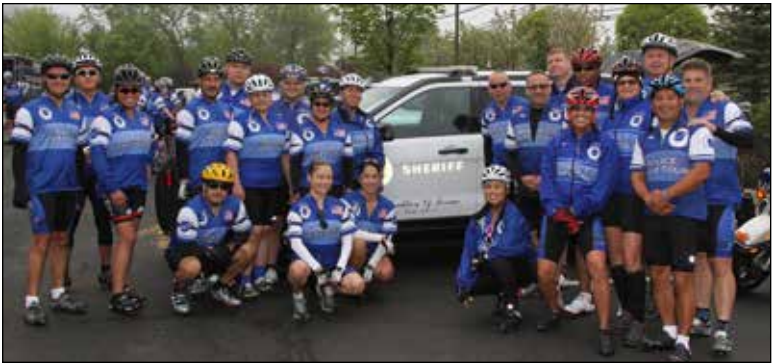
Sheriff's participate in the Police Unity Tour

forcement Officer's Memorial in Washington D.C. Additional sheriff and police officials will join the tour to provide support for riders, making this one of the largest law enforcement events in the United States. This year's ride is especially memorable, as it will mark the event's twentieth anniversary. The Police Unity Tour is the largest donor to the National Law Enforcement Memorial Fund. Last year's event raised over $1.9 million, which was donated to the National Law Enforcement Officer's Memorial Fund. Since 1997, donations total nearly $18 million. Funds received through donations go toward careful and respectful maintenance of the Memorial, which contains the names of over 20,000 fallen heroes. It receives year-round care including re-engraving, coating and sealing of the names, as well as the cleaning of the walls and other memorial improvements. The Police Unity Tour's motto, which is simply stated, "We Ride For Those Who Died," is just that: Law enforcement personnel joining together to complete a bicycle tour, raising awareness for their professional brothers and sisters who died in the line of duty, and raise funds for the National Law Enforcement Officer's Memorial