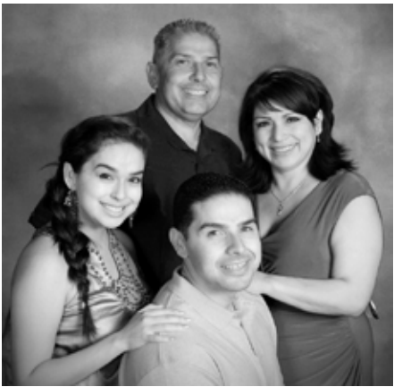
Lujan family owned