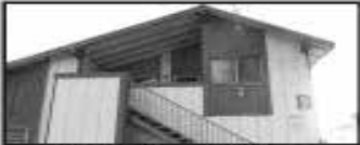
857 Silver Fir Rd Diamond Bar - $310,000