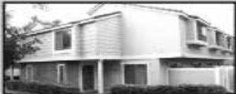
520 Golden Springs Dr. #A Diamond Bar - $385,000

These are some of my $20 million in SALES in 2016!