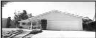
23846 Decorah Road Diamond Bar - $540,000