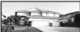
4839 Sapphire Rd Chino Hills - $735,000