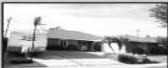
825 Rolling Hills Fullerton - $705,000