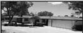
15234 Las Flores Ave La Mirada - $699,000