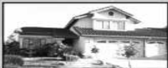
1202 Longview Dr Diamond Bar - $740,000