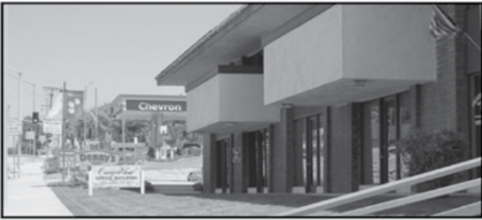
Canyon View Offices at 21308 Pathfinder Rd., Diamond Bar

Diamond Bar-Canyon View Plaza is an ideal location for multipurpose offices with 24/7 access to building. Located right next to the 57 and 60 fwy makes it highly visible and easy to find. It is across the street from Diamond Bar High School and Chevron Gas Station. Offices are all inclusive. Starting at $600 for an executive suite. Offices range in different size up to 2300 sq ft. Free utilities, including water, trash, gas, gardening and cleaning service. Verizon is the phone carrier. Wireless internet FIOS and direct tv are available. Great space for office, retail, medical, acupuncture, nail salon, beauty salon, and school related business like tutoring. Some of the current tenants are psychologist, dentist, beauty salon, real estate brokers, mortgage brokers, tutoring, driving school, music teacher, art studio, doctor, Diamond Bar Tailoring, and used car dealers.