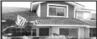
1107 Golden Springs Dr #D Diamond Bar - $335,000