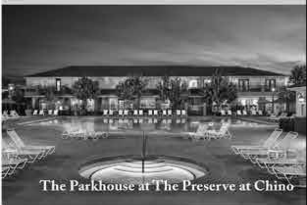
The Parkhouse at The Preserve at Chino