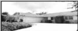
323 S Del Sol Ln Diamond Bar - $550,000