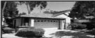
1221 N. Diamond Bar Blvd Diamond Bar - $450,000