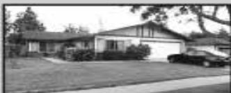
9373 Calle Vejar RCUC - $400,000