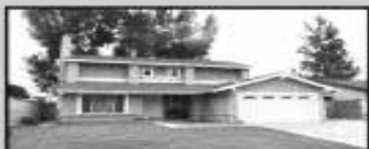
19810 Camino Arroyo Walnut - $740,000