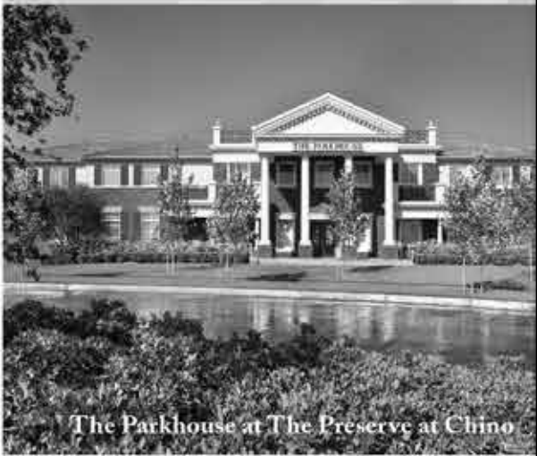
The Parkhouse at The Preserve at Chino