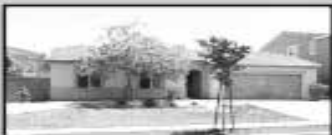
34230 Sundew Ct Lake Elsinore - $285,000