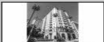
455 Ocean Blvd #206 Long Beach - $220,000