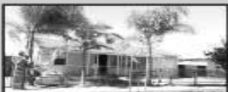
5609 Rosemead Blvd Pico Rivera - $420,000