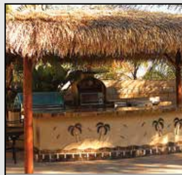
Extreme Backyard Designs is located at 2330 S. Vineyard Ave. They can be reached at 909.930.6111 or online at www.extremebackyarddesigns.com . See their Ad on page 8.