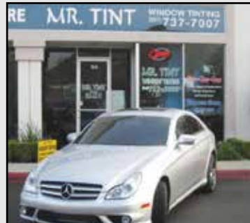
Mr. Tint is conveniently located just minutes from Eastvale at 1780 Town and Country Drive, #104, in Norco (near the post office and DMV). Call them at (951) 737-7007 for more information, or visit their website at http://www.mrtint-ie.com . See their Ad on Page 4.

ABCpr MEDIA GROUP • (909) 464-1200 • ANAPR.COM • 382 N. LEMON AVE. #402, WALNUT, CA 91789