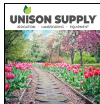
Unison Supply is located at 15715 E. Valley Blvd. in City of Industry. For more info visit their website at www.unisonsupply.com or call 626-333-1553. See their ad on pg 7.

ABCPR MEDIA GROUP • (909) 464-1200 • ANAPR.COM • 382 N. LEMON AVE. #402, WALNUT, CA 91789