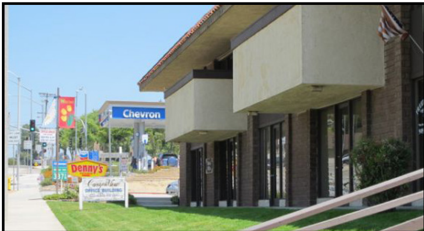
Canyon View Offices at 21308 Pathfinder Rd., Diamond Bar

Diamond Bar-Canyon View Plaza is an ideal location for multipurpose offices with 24/7 access to building. Located right next to the 57 and 60 fwy makes it highly visible and easy to find. It is across the street from Diamond Bar High School and Chevron Gas Station. Offices are all inclusive. Starting at $800 for an executive suite. Offices range in different size up to 2300 sq ft. Free utilities, including water, trash, gas, gardening and cleaning service. Verizon is the phone carrier. Wireless internet FIOS and direct tv are available. Great space for office, retail, medical, acupuncture, nail salon, beauty salon, and school related business like tutoring. Some of the current tenants are psychologist, dentist, beauty salon, real estate brokers, mortgage brokers, tutoring, driving school, music teacher, art studio, doctor, Diamond Bar Tailoring, and used car dealers.