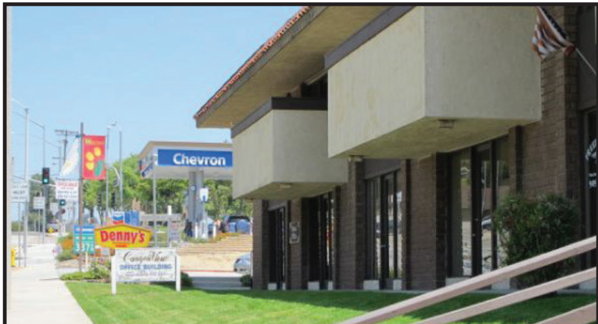
Canyon View Offices at 21308 Pathfinder Rd., Diamond Bar

Diamond Bar-Canyon View Plaza is an ideal location for multipurpose offices with 24/7 access to building. Located right next to the 57 and 60 fwy makes it highly visible and easy to find. It is across the street from Diamond Bar High School and Chevron Gas Station. Offices are all inclusive. Starting at $700 for an executive suite. Offices range in different size up to 2300 sq ft. Free utilities, including water, trash, gas, gardening and cleaning service. Verizon is the phone carrier. Wireless internet FIOS and direct tv are available. Great space for office, retail, medical, acupuncture, nail salon, beauty salon, and school related business like tutoring. Some of the current tenants are psychologist, dentist, beauty salon, real estate brokers, mortgage brokers, tutoring, driving school, music teacher, art studio, doctor, Diamond Bar Tailoring, and used car dealers.