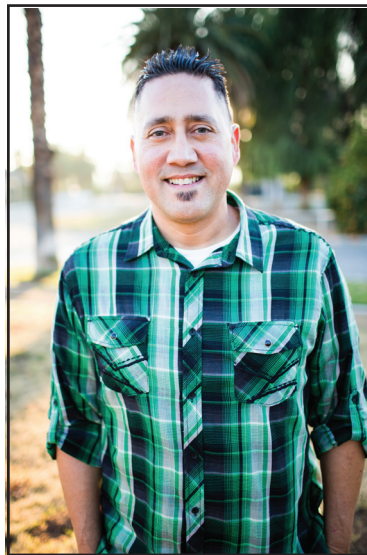
temporarily meeting in a "Drive In format" at American Heroes Park at 8:30am and 10:30am. All midweek services can be viewed on Facebook Live at 7pm. All of our services can be viewed on our Facebook Channel (Calvary Eastvale). Download our online bulletin to stay current at calvaryeastvale.org .

Due to school closures, Calvary Chapel Eastvale is