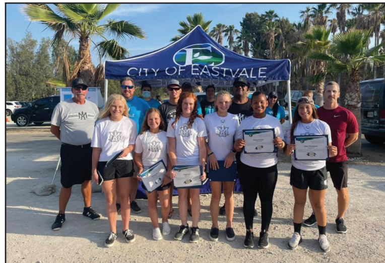
Mercado Fitz 08 team recently competed in the Triple Crown Tournament and faced teams that ranked #1 in the Nation and others in the top 10 of the country