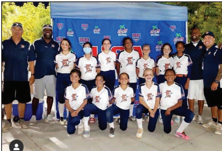
The Eastvale 10u Allstar team recently played in the state tournament in Lancaster.

Completed applications and any questions about the program can be sent to eastvalecityyouthcouncil@gmail.com . Deadline to submit the application is Friday September 3rd at 11:59pm. For more information click here: https://bit.ly/3CY6kzG