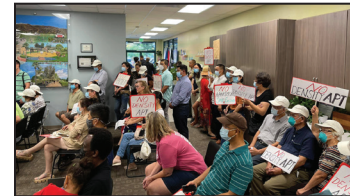
Several community members carried "No Apt" signs and voiced their opinions at the July 28 City Council meeting.

The main concerns of the community are the increased see Apartments page 4