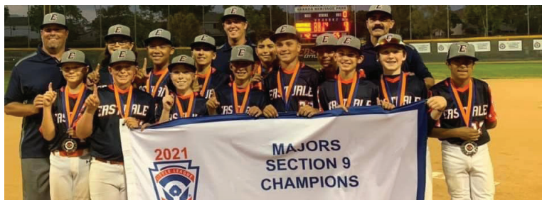
The Eastvale Little League 12s team won the Section 9 Championship and moved on to the Southern California Divisional tournament.