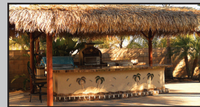
Extreme Backyard Designs is located at 2330 S. Vineyard Ave. in Ontario. They can be reached at 909.930-6111 or online at www.extremebackyarddesigns.com

ABC PUBLIC RELATIONS • (909) 464-1200 • ANAPR.COM • 13191 9TH STREET SUITE B CHINO, CA 91710