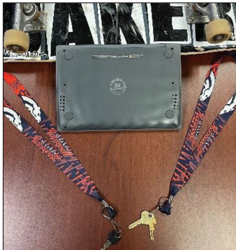
Two Master Keys were stolen, which per school administration would cost the high school approximately $25,000 to re-key the entire school.

Anyone with further information about this incident or if you suspect drug activity in your area, please contact the Jurupa Valley Sheriff’s station. The Jurupa Valley Special Enforcement Team can be reached at 951-955-2600.