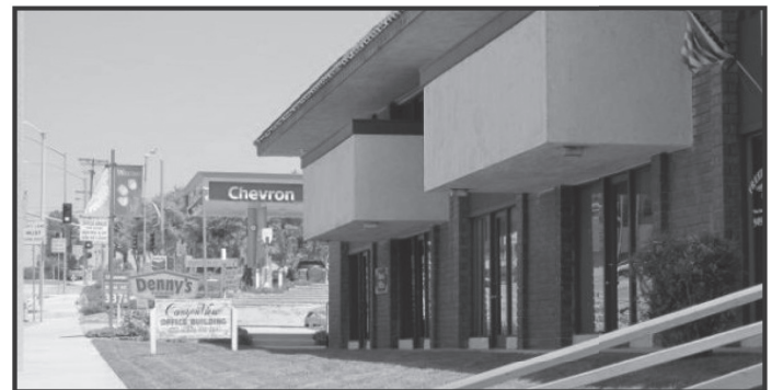
Canyon View Offices at 21308 Pathfinder Rd., Diamond Bar

Diamond Bar-Canyon View Plaza is an ideal location for multipurpose offices with 24/7 access to building. Located right next to the 57 and 60 fwy makes it highly visible and easy to find. It is across the street from Diamond Bar High School and Chevron Gas Station. Offices are all inclusive. Starting at $700 for an executive suite. Offices range in different size up to 2300 sq ft. Free utilities, including water, trash, gas, gardening and cleaning service. Verizon is the phone carrier. Wireless internet FIOS and direct tv are available. Great space for office, retail, medical, acupuncture, nail salon, beauty salon, and school related business like tutoring. Some of the current tenants are psychologist, dentist, beauty salon, real estate brokers, mortgage brokers, tutoring, driving school, music teacher, art studio, doctor, Diamond Bar Tailoring, and used car dealers.