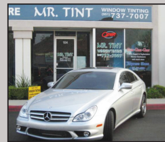
Mr. Tint is conveniently located just minutes from Eastvale at 1780 Town and Country Drive, #104, in Norco (near the post office and DMV). Call them at (951) 737-7007 for more information, or visit their website at http://www.mrtint-ie.com .