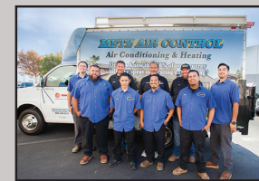
Customers participating in Maintenance Protection Plans receive a 24-hour turn-around service as well as discounts for parts and service. Please call the office @ 909-628-9525 for more information about this program.