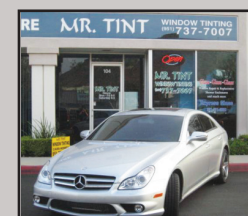
Mr. Tint is conveniently located just minutes from Eastvale at 1780 Town and Country Drive, #104, in Norco (near the post office and DMV). Call them at (951) 737-7007 for more information.