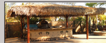
Extreme Backyard Designs is located at 2330 S. Vineyard Ave. in Ontario. They can be reached at 909.930-6111 or online at www.extremebackyarddesigns.com