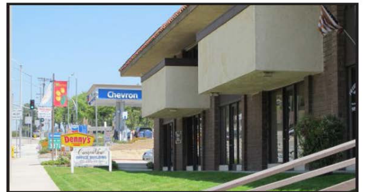
Canyon View Offices at 21308 Pathfinder Rd., Diamond Bar

Diamond Bar-Canyon View Plaza is an ideal location for multipurpose offices with 24/7 access to building. Located right next to the 57 and 60 fwy makes it highly visible and easy to find. It is across the street from Diamond Bar High School and Chevron Gas Station. Offices are all inclusive. Starting at $700 for an executive suite. Offices range in different size up to 2300 sq ft. Free utilities, including water, trash, gas, gardening and cleaning service. Verizon is the phone carrier. Wireless internet FIOS and direct tv are available. Great space for office, retail, medical, acupuncture, nail salon, beauty salon, and school related business like tutoring. Some of the current tenants are psychologist, dentist, beauty salon, real estate brokers, mortgage brokers, tutoring, driving school, music teacher, art studio, doctor, Diamond Bar Tailoring, and used car dealers.