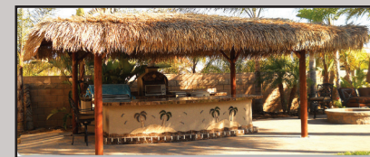
Extreme Backyard Designs is located at 2330 S. Vineyard Ave. in Ontario. They can be reached at 909.930-6111 or online at www.extremebackyarddesigns.com

ABC PUBLIC RELATIONS • (909) 464-1200 • ANAPR.COM • 13191 9TH STREET SUITE B CHINO, CA 91710