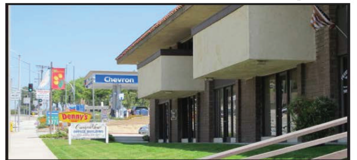
Canyon View Offices at 21308 Pathfinder Rd., Diamond Bar

Diamond Bar-Canyon View Plaza is an ideal location for multipurpose offices with 24/7 access to building. Located right next to the 57 and 60 fwy makes it highly visible and easy to find. It is across the street from Diamond Bar High School and Chevron Gas Station. Offices are all inclusive. Starting at $700 for an executive suite. Offices range in different size up to 2300 sq ft. Free utilities, including water, trash, gas, gardening and cleaning service. Verizon is the phone carrier. Wireless internet FIOS and direct tv are available. Great space for office, retail, medical, acupuncture, nail salon, beauty salon, and school related business like tutoring. Some of the current tenants are psychologist, dentist, beauty salon, real estate brokers, mortgage brokers, tutoring, driving school, music teacher, art studio, doctor, Diamond Bar Tailoring, and used car dealers.