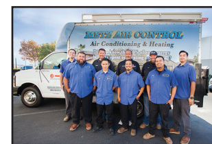
Metz Air Control is a family-owned business that provides excellent customer service. They are located in Chino. For more information, call the office at 909-628-9525.