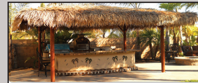
Extreme Backyard Designs is located at 2330 S. Vineyard Ave. in Ontario. They can be reached at 909.930-6111 or online at www.extremebackyarddesigns.com