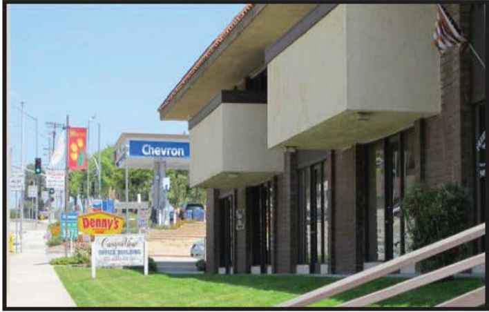
Canyon View Offices at 21308 Pathfinder Rd., Diamond Bar

Diamond Bar-Canyon View Plaza is an ideal location for multipurpose offices with 24/7 access to building. Located right next to the 57 and 60 fwy makes it highly visible and easy to find. It is across the street from Diamond Bar High School and Chevron Gas Station. Offices are all inclusive. Starting at $700 for an executive suite. Offices range in different size up to 2300 sq ft. Free utilities, including water, trash, gas, gardening and cleaning service. Verizon is the phone carrier. Wireless internet FIOS and direct tv are available. Great space for office, retail, medical, acupuncture, nail salon, beauty salon, and school related business like tutoring. Some of the current tenants are psychologist, dentist, beauty salon, real estate brokers, mortgage brokers, tutoring, driving school, music teacher, art studio, doctor, Diamond Bar Tailoring, and used car dealers.