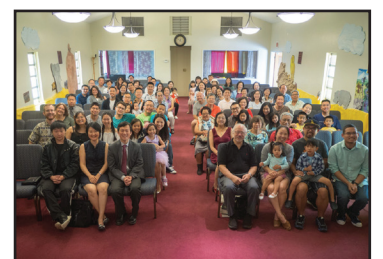
Riverside Christian Alliance Church meets every Sunday at 10:30 a.m. Visit www.riversidecma.org for more information.