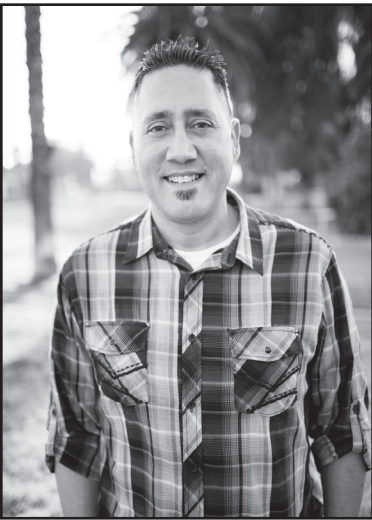
Calvary Eastvale meets Sundays 8:30 and 10:30am at the Eastvale Community Center (calvaryeastvale.org).

almost assured we will never accomplish anything of value. Instead of being discouraged by opposition, we should take comfort in God’s faithfulness and keep on doing what is right. Whatever you find yourself up against today, remember that “one,” with God is really the majority. He is all powerful and He is for “you” (Romans 8:31). He sees what you don’t see. Faith is trusting and believing God. God is in the business of doing the impossible (Matthew 19:26). If Christ is in your heart, you are able to stand tall and walk in His strength today.