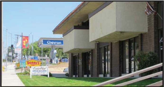
Canyon View Offices at 21308 Pathfinder Rd., Diamond Bar