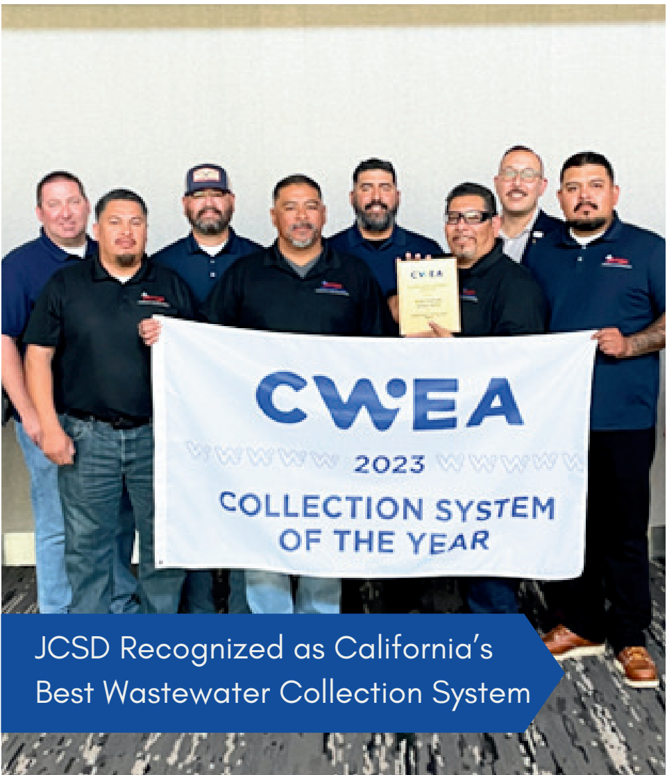
JCSD Recognized as California's Best Wastewater Collection System