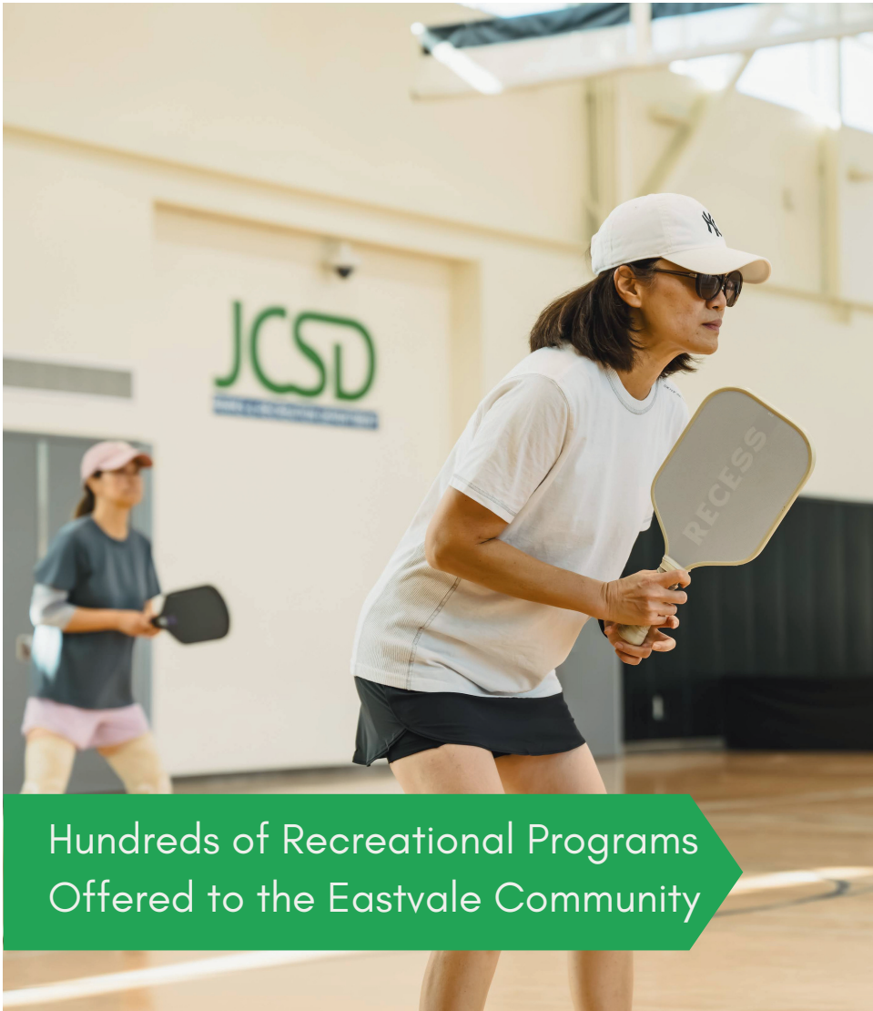
Hundreds of Recreational Programs Offered to the Eastvale Community