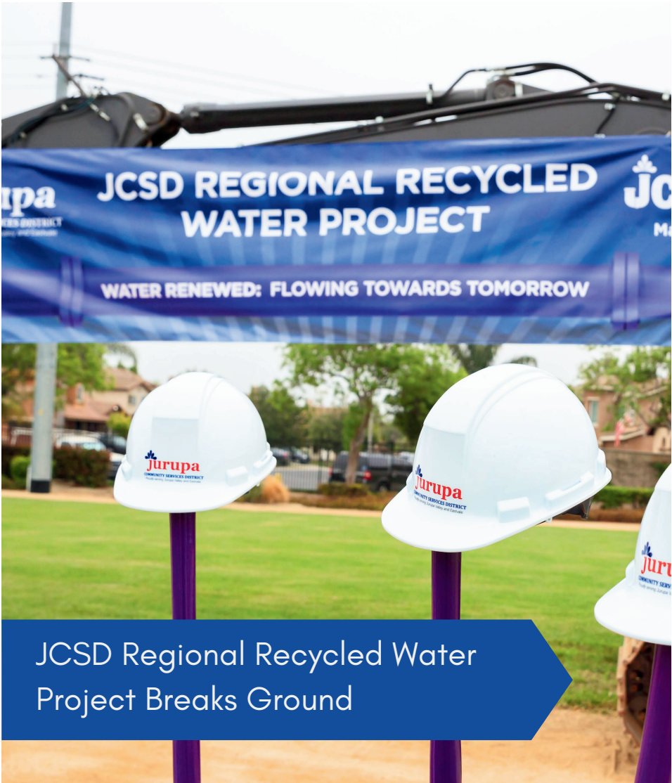
JCSD Regional Recycled Water Project Breaks Ground