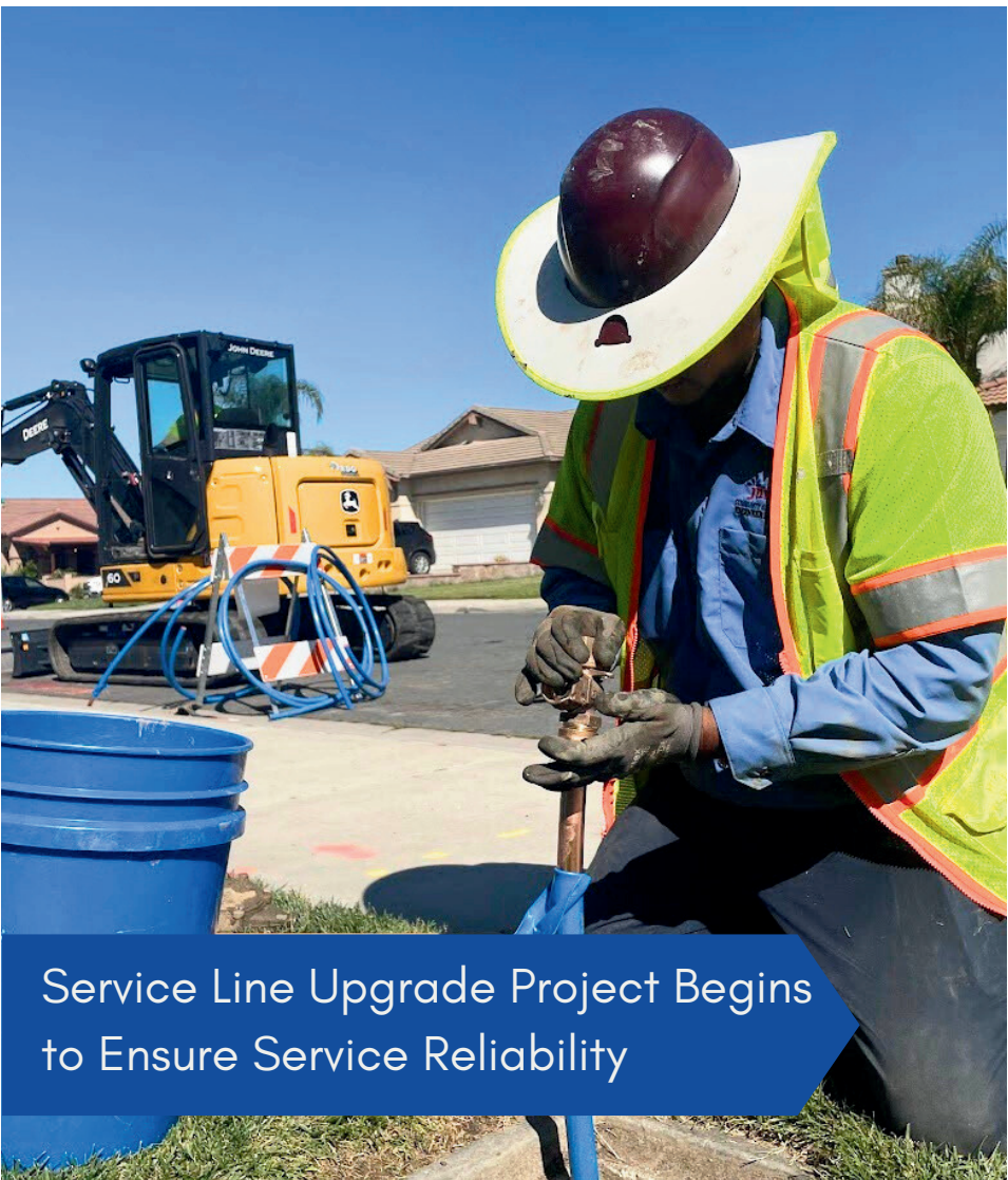
Service Line Upgrade Project Begins to Ensure Service Reliability