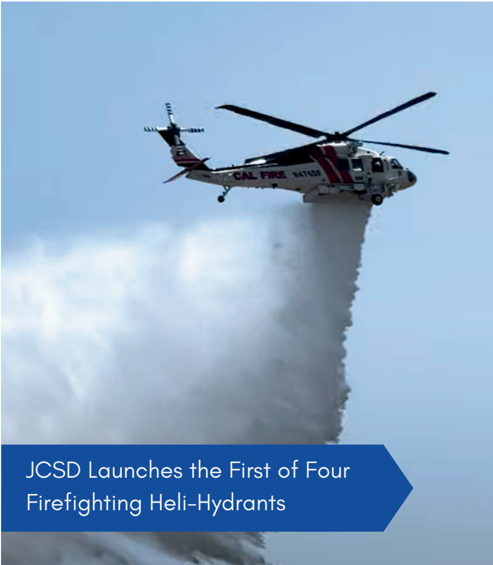
JCSD Launches the First of Four Firefighting Heli-Hydrants