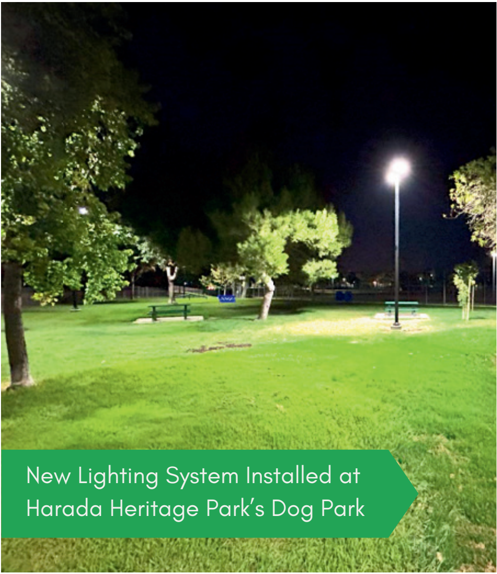
New Lighting System Installed at Harada Heritage Park's Dog Park