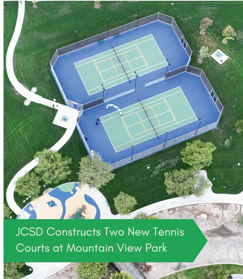
JCSD Constructs Two New Tennis Courts at Mountain View Park