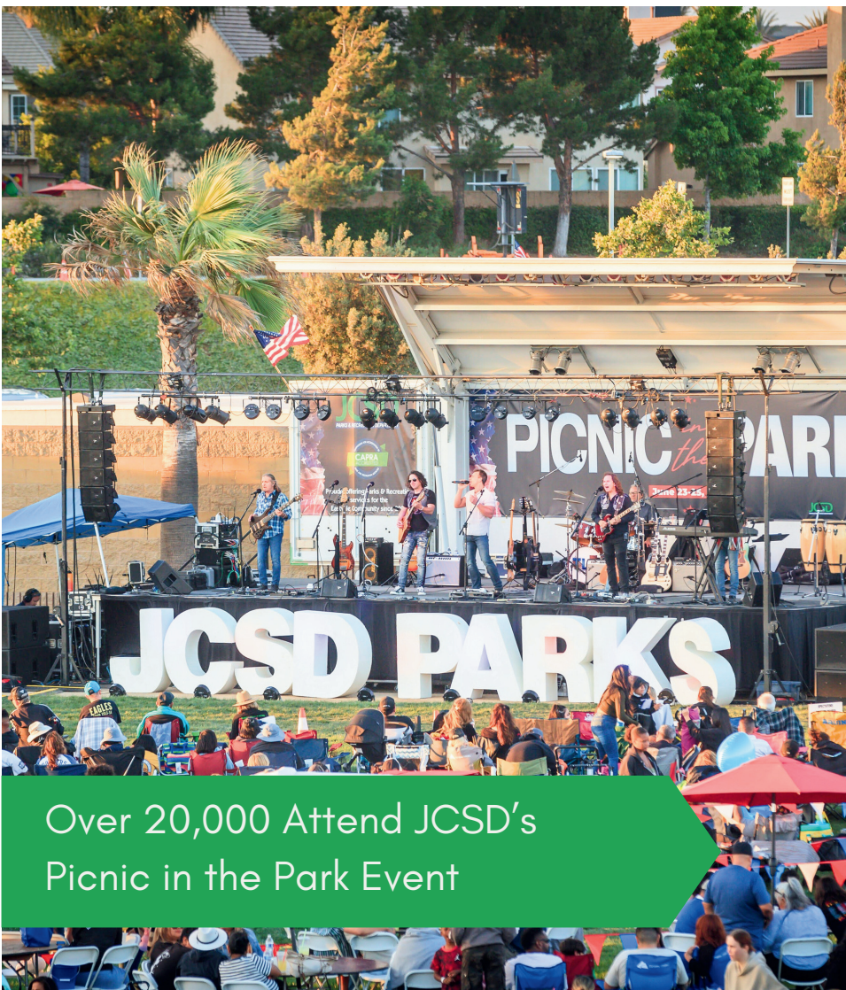
Over 20,000 Attend JCSD's Picnic in the Park Event